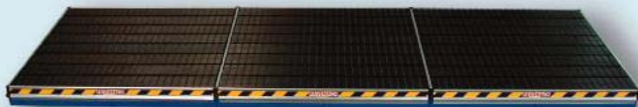
FLOORING WITH RAISED MODULES