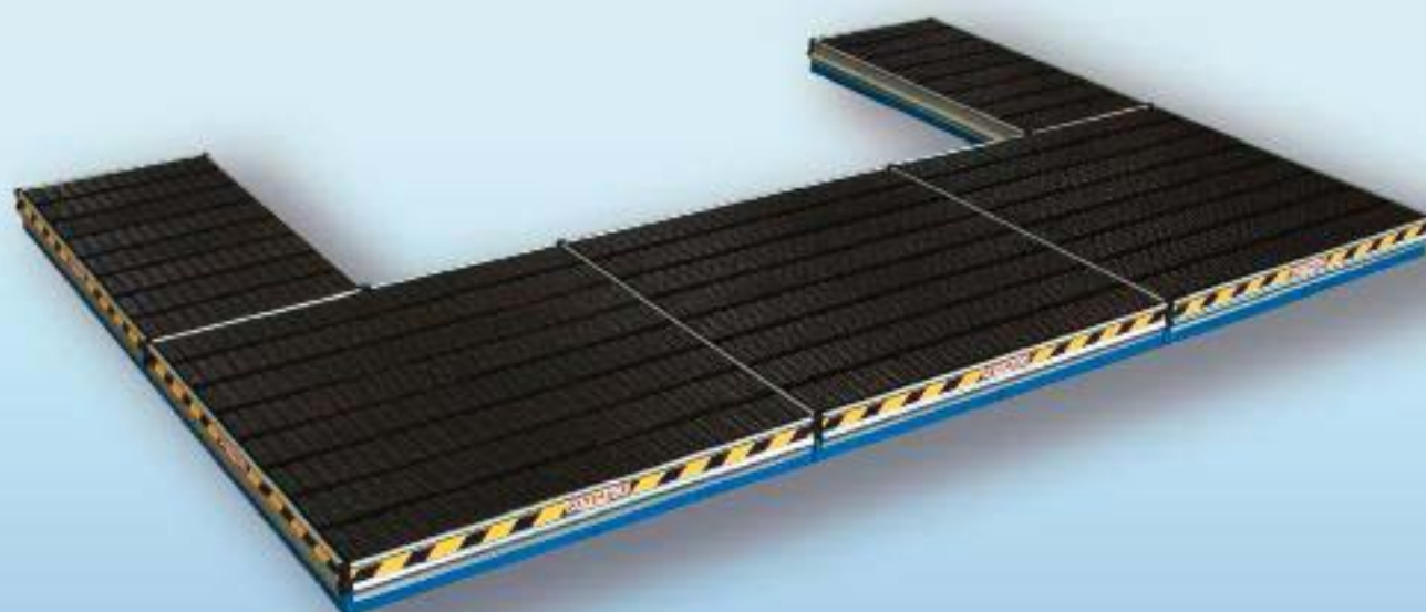
FLOORING WITH RAISED MODULES AND COMBINED SYSTEM BY